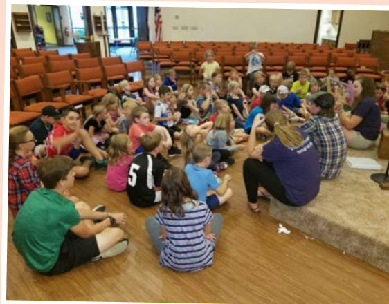
VBS at Immanuel Lutheran Church