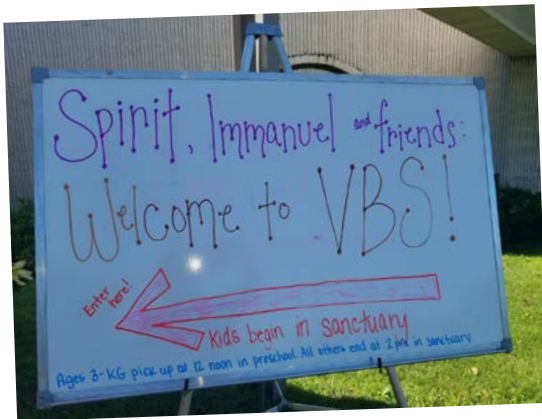
VBS pictures inside!

Spirit's congregational budget meeting is on Sunday, August 20, 2017! Join us for an informational session held in the sanctuary following worship. Budget sheets are available for pick up in the narthex.