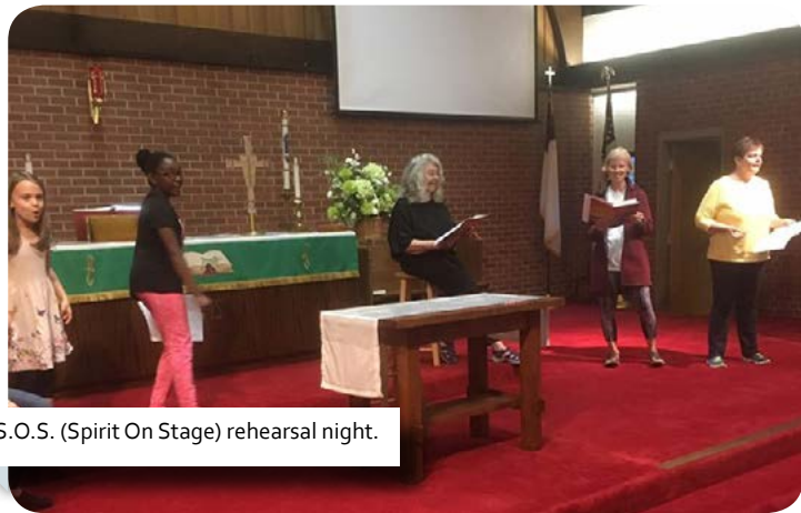
S.O.S. (Spirit On Stage) rehearsal night.