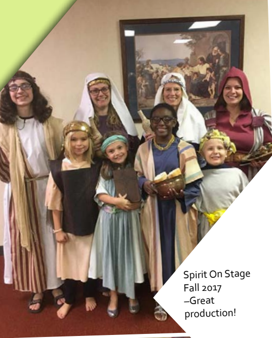
Spirit On Stage Fall 2017 —Great production!